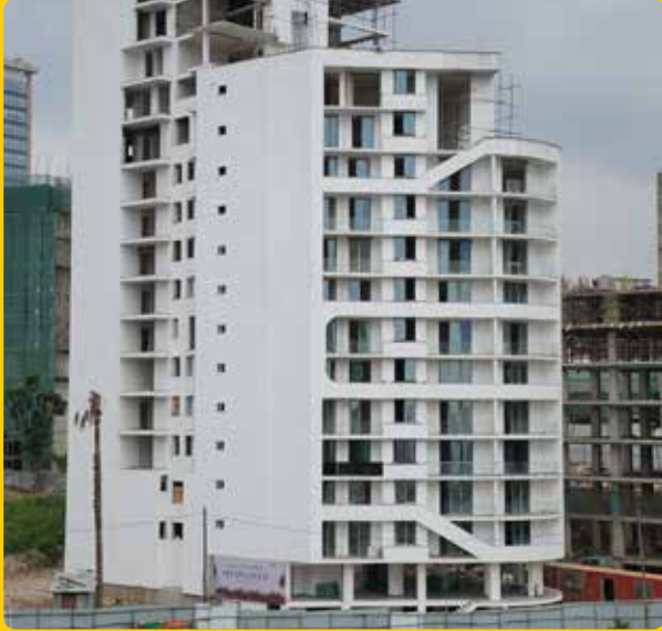
✔ PARK VIEW