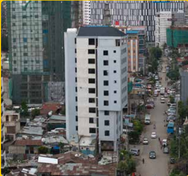
✔ ONE BY AKOYA