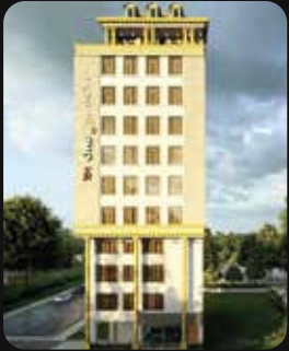
DEMBEL ONE BY AKOYA